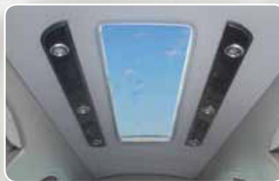
The Icon comes standard with a skylight to illuminate the rear compartment.