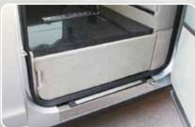
A closed church truck well provides floor space for floral arrangements and a clean, spacious appearance.