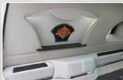
The interior landau trim panel features LED lighting, decorative materials and double-needle tailoring for an elegant and sophisticated look.