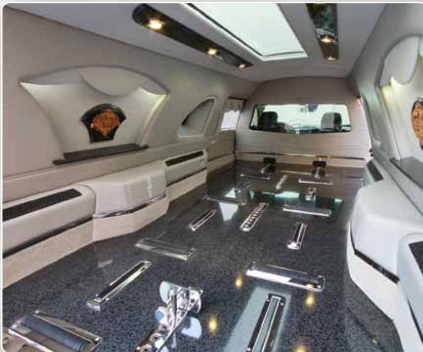
The Icon features a beautifully-appointed rear compartment, an Urn Enclave, luxurious interior fabrics, and a casket floor that measures 122-inches long and 43.5-inches wide.

The Lincoln MKT Eagle Icon... the next generation of finely-crafted Lincoln professional vehicles from Eagle Coach Company.